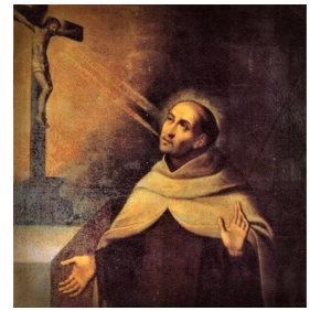
OHF John of the Cross

With zeal have I been zealous for the Lord God of hosts. 1 Kgs 10:19