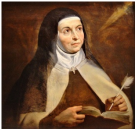
OHM Teresa of Ávila