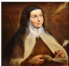
OHM Teresa of Ávila