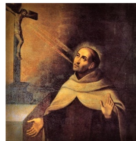
OHF John of the Cross

With zeal have I been zealous for the Lord God of hosts. 1 Kgs 10:19