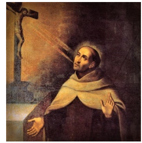
OHF John of the Cross

With zeal have I been zealous for the Lord God of hosts. 1 Kgs 10:19