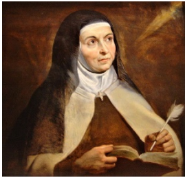
OHM Teresa of Ávila