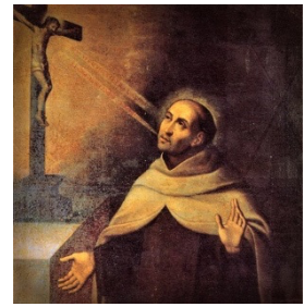
O.H.F. John of the Cross

With zeal have I been zealous for the Lord God of hosts. 1 Kgs 10:19