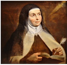
O.H.M. Teresa of Ávila