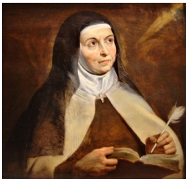
OHM Teresa of Ávila