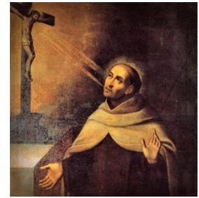
OHF John of the Cross

With zeal have I been zealous for the Lord God of hosts. 1 Kgs 10:19