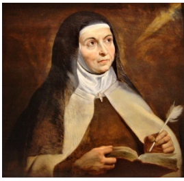
OHM Teresa of Ávila