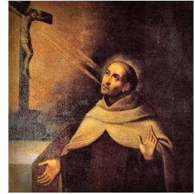
OHF John of the Cross

With zeal have I been zealous for the Lord God of hosts. 1 Kgs 10:19