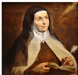
OHM Teresa of Ávila