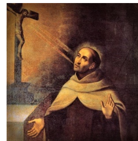
OHF John of the Cross

With zeal have I been zealous for the lord God of hosts. 1 Kgs 10:19